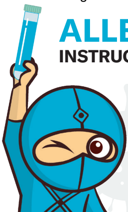
TEST TUBE WITH SOLUTION

DO NOT BRUSH YOUR TEETH, USE CHEWING GUM, DRINK, EAT OR SMOKE FOR 30 MINUTES BEFORE DOING THE TEST.